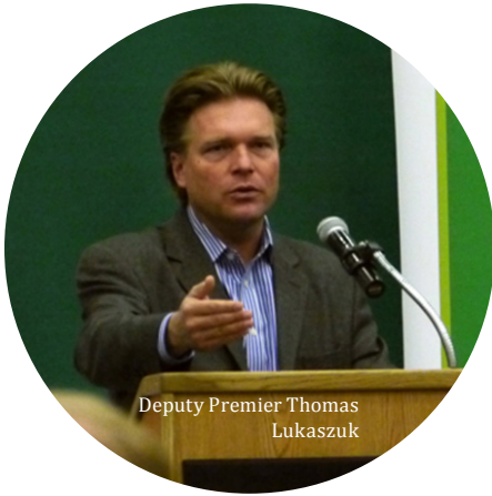
Deputy Premier Thomas Lukaszuk

AU'S ANNUAL BUSINESS COMMUNITY Breakfast was held in Athabasca on September 25 with special guests Deputy Premier Thomas Lukaszuk and Education Minister and Athabasca-Redwater MLA Jeff Johnson. The event provides a yearly opportunity for AU to thank the community for its support.