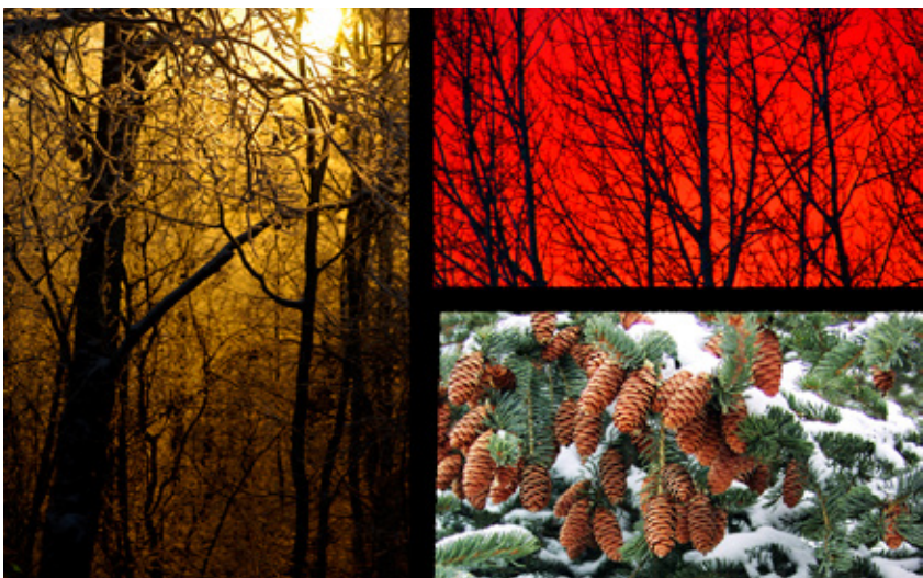
The three dozen photographs in the exhibit include winter scenes, animals (vertebrates, insects, spiders), plants, fungi and depictions of exotic locales. It is Holmberg's second exhibit at AU. His first, in 2011, included two dozen nature photographs.

The exhibit, held with the co-operation of the Art Committee, will continue until April 15. It can be found in the hallways between the library and the main door of the science laboratories. Please direct comments or questions to Holmberg .