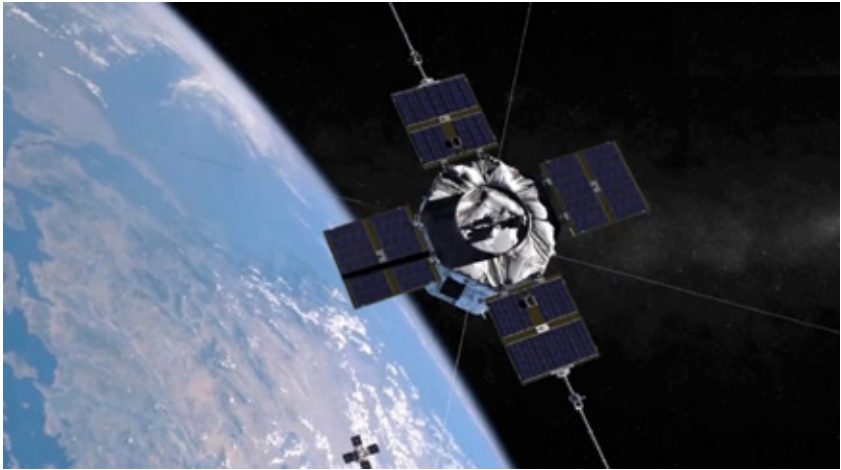
This NASA illustration shows the Van Allen Probes that orbit earth detecting chorus waves generated by electrons in Earth's radiation belt.

AUGO II's radio antenna is provided by Nagoya University's Solar-Terrestrial Environment Laboratory, a key partner with NASA in this research.