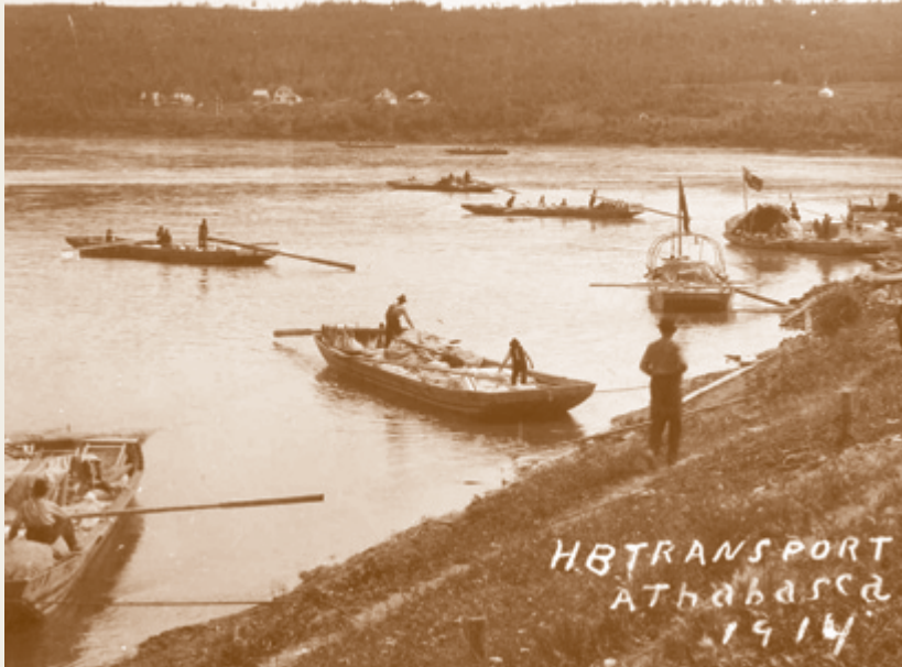
Transportation on the Athabasca River in 1914.