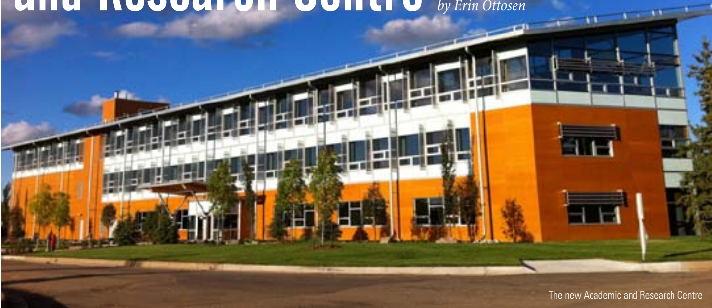
The new Academic and Research Centre

Three storeys tall, over 5,000 m 2 in area and nearly four years in the making, AU's $30 million Academic and Research Centre was officially opened by Premier Ed Stelmach on July 29.