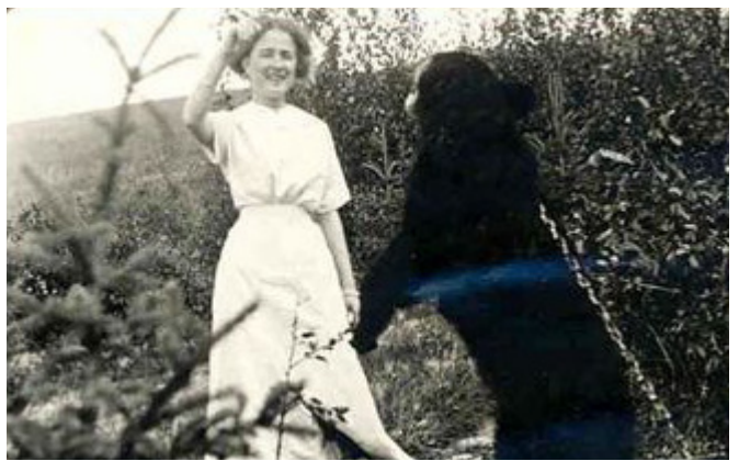
An unknown woman with a bear, from the Thomas A. Edge Archives and Special Collections. The photo is part of the Alberta Women's Memory Project.

On November 15, the Alberta Women's Memory Project is holding A Celebration of Women's Voices from the Past to the Future, the project's inaugural fundraiser, in Edmonton.