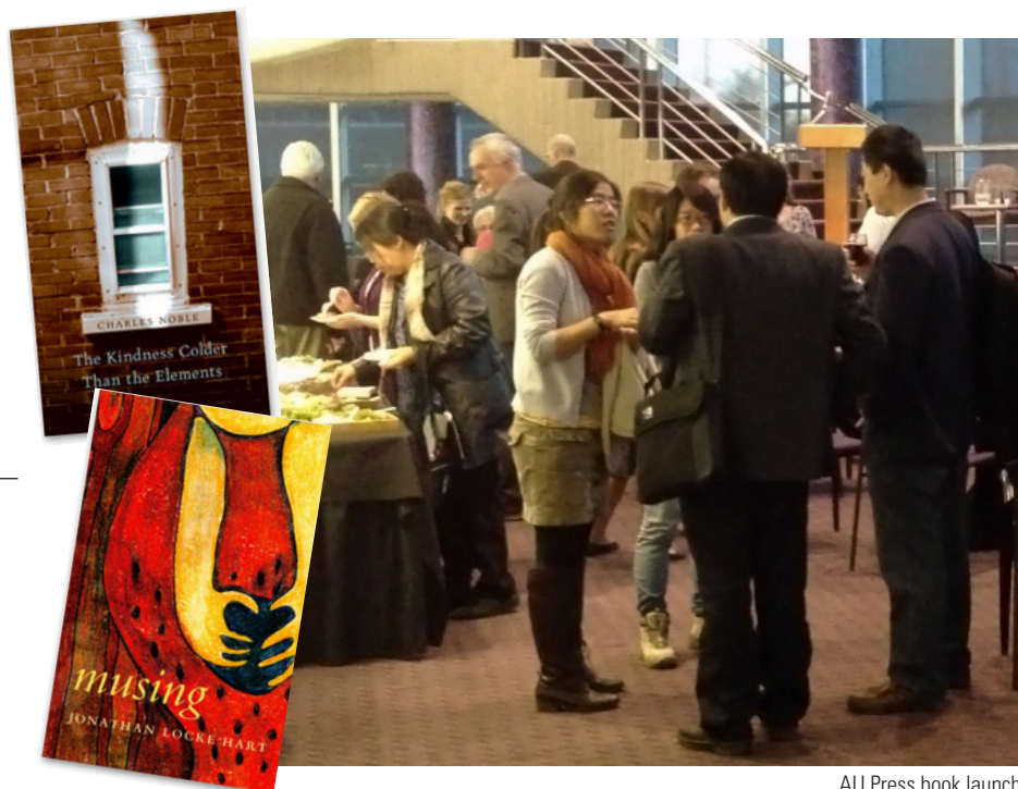
AU Press book launch.

The book launch for Musing and The Kindness Colder Than the Elements . AU Press would like to express their gratitude to everyone who attended and supported the event. A great time was had by all.